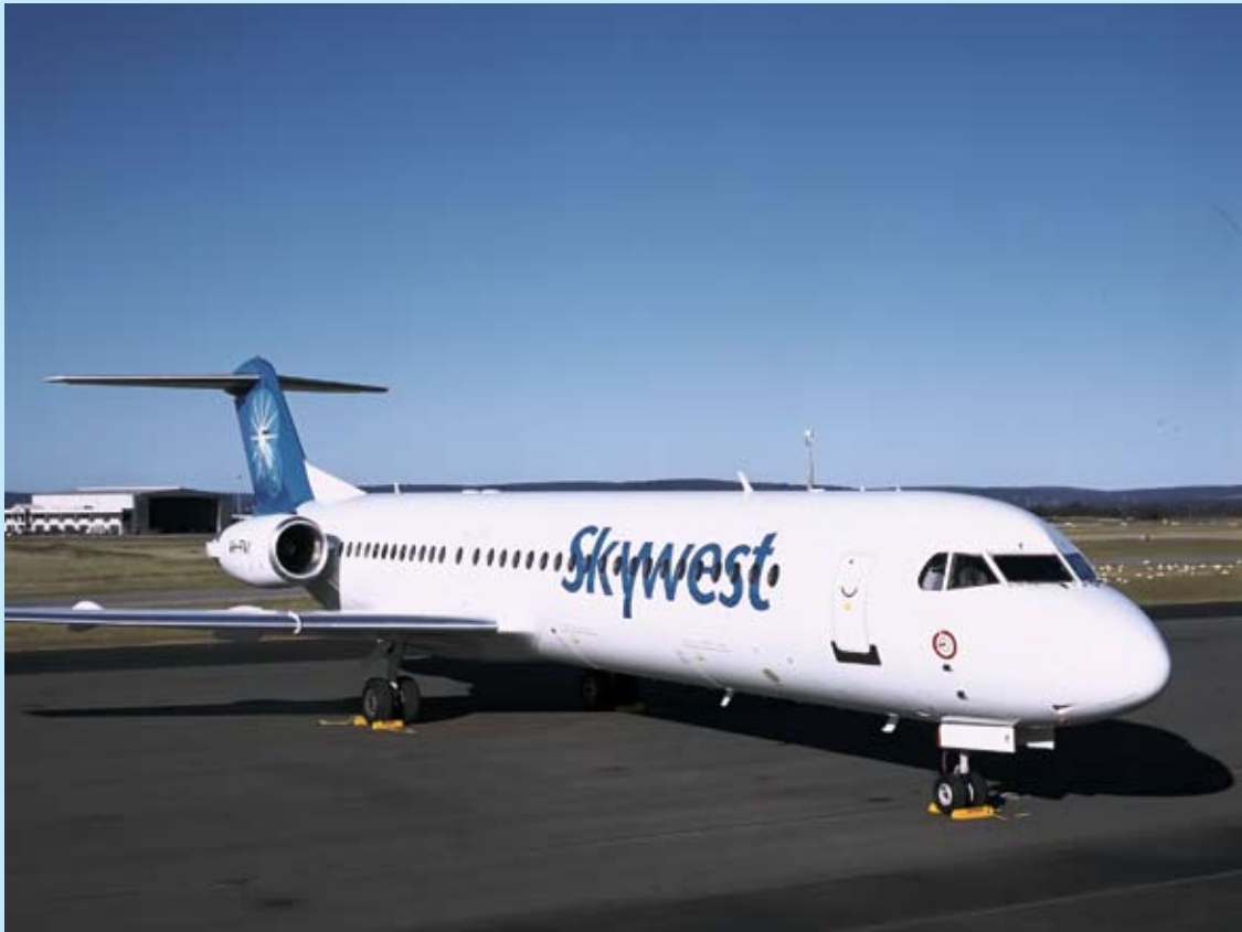
Fokker F100 Regional Jet M.S.N. 11484 leased to Skywest Airlines. Perth Airport – Western Australia.