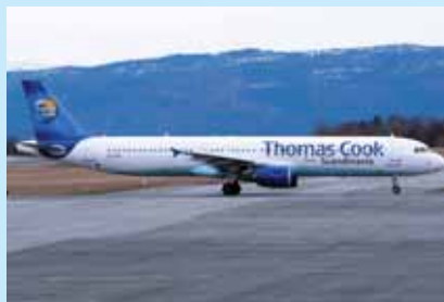
Airbus A321-200 MSN 1881 30 June 2008 Thomas Cook (OY-VKA) Europe, Scandinavia