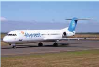
Fokker 100 MSN 11484 11 April 2007 Skywest Airlines (VH-FNY) Western Australia, Northern Territory, Bali