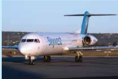
Fokker 100 MSN 11391 31 July 2008 Skywest Airlines (VH-FSW) Western Australia