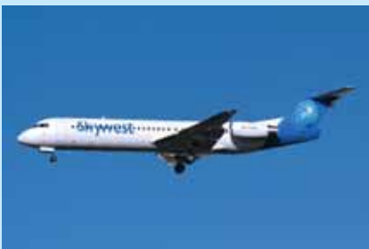
Fokker 100 MSN 11326 28 September 2007 Skywest Airlines (VH-FNN) Western Australia